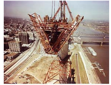
The Arch began to tip at very odd angles as completion neared